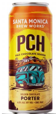
PCH GOLDEN CHOCOLATE PORTER