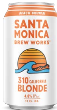
310 CALIFORNIA BLONDE ALE

No, we don't use sand or saltwater in our beer. "Beach Brewed" is lifestyle. It's a laid-back state of mind. In a city that celebrates summertime year-round, these California classics will transport your senses with every sip.