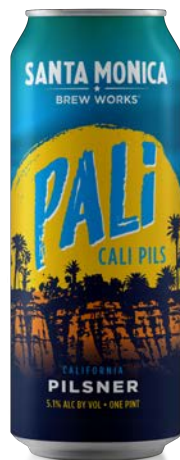
PALI CALI PILS WEST COAST-STYLE PILSNER